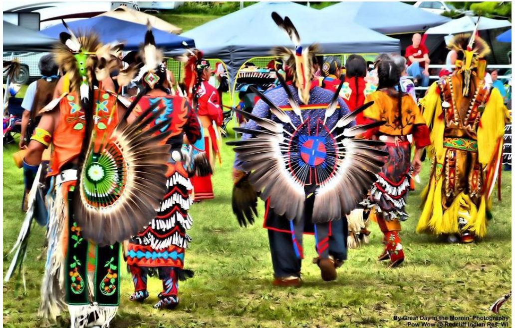
Pow Wow @ Red Cliff Indian Res. WI